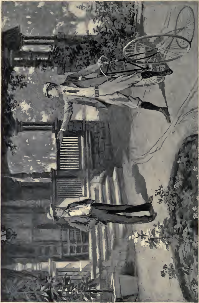
FRED MELVERTON LEAVES GID KETERELL IN POSSESSION. (SEE PAGE 5.)